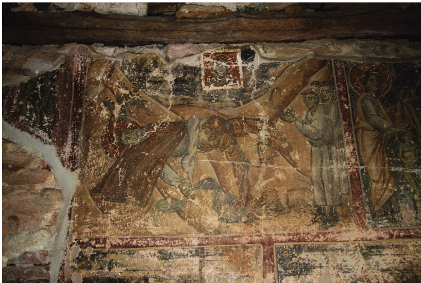
Fig. 6: The devouring scene, St. George chapel in the tower of St. George belonging to Chilandar monastery, chapel's southern façade, 13 th century (site: http://www.monumentaserbica.com/mushushu/story.php?id=52 )