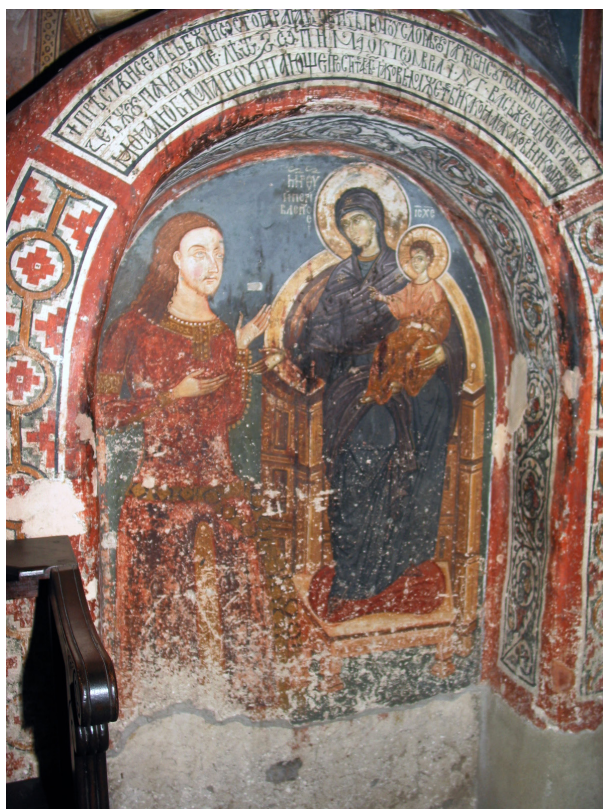
Fig. 1: Arcosolium tomb of Ostoja Rajaković, the Virgin Peribleptos in Ohrid, 14 th century

In conclusion, while the verse from the poem of the Three Living and the Three Dead was appropriated to be used in the same creative way as it was in the West, the explicit image of a decaying body was rejected because it was understood to promote the doctrine of purgatory.