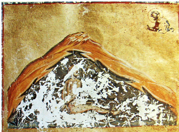
Fig. 3: The soul trapped in Hades , cod. Dionysiou 65, fol. 12r, 12 th century (from: S. M. Pelekanidis et al., The Treasures of Mount Athos: Illuminated manuscripts , vol. 1, Athens 1974)