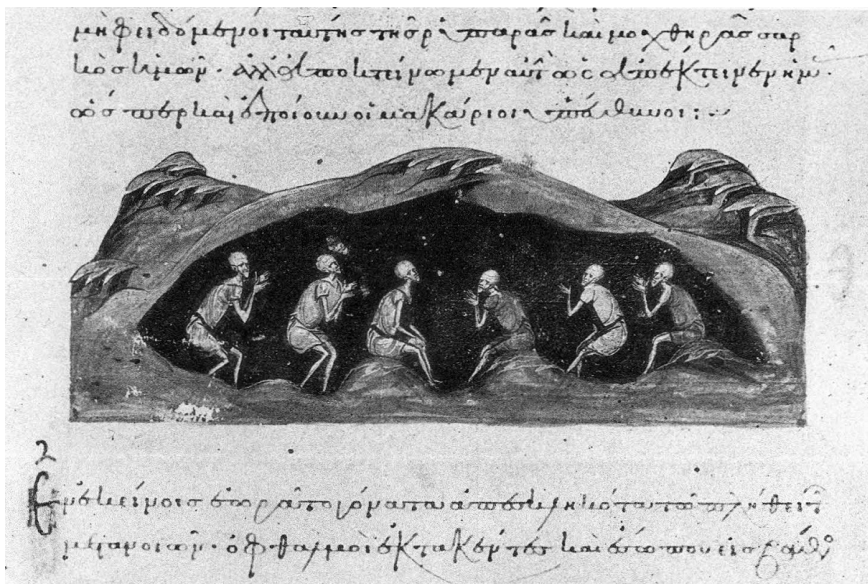
Fig. 4: The ascetic penance, Vat. gr. 394, fol. 46r, 11 th century (from: J. R. Martin, The Illustration of the Heavenly Ladder of John Climacus , Princeton 1954)