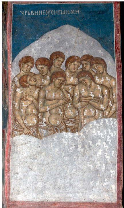
Fig. 2: The worm that never sleeps , Dečani monastery, 14 th century