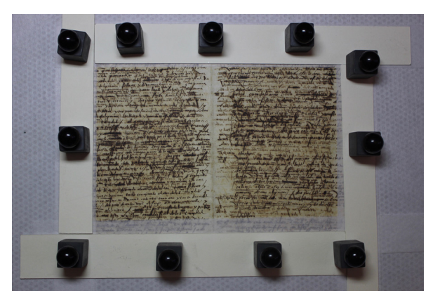
Fig. 6: A bifolium positioned on the steel frame for drying at natural ventilation, magnetic pads all around its perimeter

After this first step, on the more damaged bifolia , XRF and FORS measurements were carried out again on 20 points (15