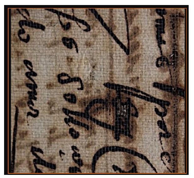
Fig. 3: Detail of the silk lining on the text

The project involved the participation of archivists, chemists and conservators and was conceived as an open project, which would be gradually outlined on the basis of data acquired from the analysis performed before, during and after the conservation steps by means of non-destructive and non-invasive spectroscopic techniques, in order to obtain information and to plan a punctual and suitable