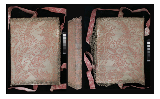
Fig. 1: Diario's silk cover (18th century)

ff. 42, 43 and 44, were lined on both sides with silk to prevent the risk of paper fragmentation (Fig. 3).