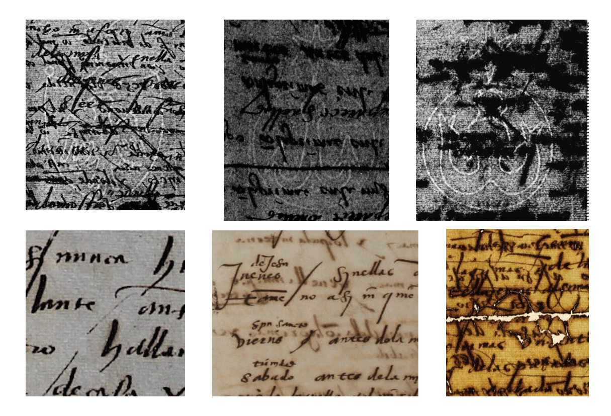
Fig. 2: Leaf fragments showing watermarks (first row, transmitted light) and degradation induced by iron gall inks (second row, reflection light). The images were taken after silk removal (see text)

characterization of iron-gall inks and paper was carried out to evaluate the reasons for the different degradation levels of the leaves. The second step was the evaluation of iron and ink distribution on the leaves before and after each intervention step to establish the impact, specifically for the water-based steps. To this purpose, we used X-Ray fluorescence (XRF) to probe iron distribution/diffusion, as well as the type of metallic ions present in the ink.<sup>5</sup>