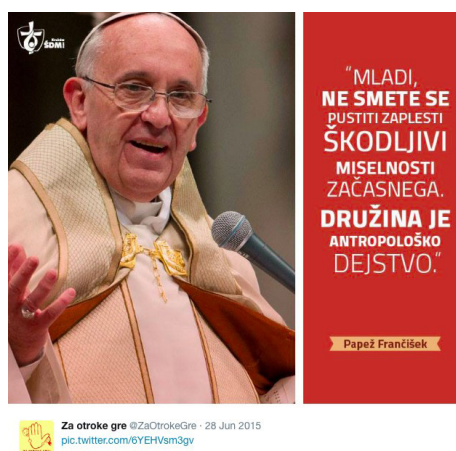
Figure 2: A ZOG tweet referencing the ultimate authority on the normative family and the accompanying text: “You, the youth, should not be led astray by the harmful transient ideologies. Family is an anthropological fact.’ Pope Francis”.

representing a quarter of the posts. The authors of the ZOG campaign used the strategy of reproducing the traditional concept of the family and relied on the fact that this is recognized as the natural order within the hegemonic heterosexual discourse. This hegemonic heterosexual discourse, which follows the formula “family = mother, father and children”, appeared to be successful as it dominated the other topics within the ZOG campaign Twittersphere. This norm has historically been accepted as society’s preferred way of thinking, particularly from a religious perspective. At the same time, this strategy preserves the natural and social order and is also one of the most successful approaches for maintaining social inequality (van Dijk 1993, Fairclough 1985). However, it should be noted that ZOG limits the social model of the family with the concept of the Catholic normative model. Most of the tweets on this subject are directly related to this understanding of the family, as illustrated in the tweet “ Družina je Božji dar za uresničitev moškega in ženske, ki sta ustvarjena po Njegovi podobi ” (Eng. “Family is a gift from God for the realization of a man and a woman created in His image”), while Pope Francis is referred to as the ultimate authority of this model (Figure 2).