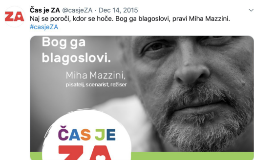
Figure 5: A tweet referencing the concept of the Catholic norm of the family.

Neither campaign refers to the other directly in their tweets. There are, however, subtle references, such as the ČJZ tweet quoting the writer and director Miha Mazzini (Figure 5): “May anyone who so wishes get married. God bless them, says Miha Mazzini.” This is one of the rare tweets that subtly address the normative topic of the Catholic concept of marriage.