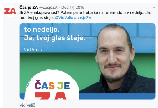
Figure 4: A tweet calling for a high voter turnout.

In contrast to ZOG, the ČJZ campaign focused specifically on the referendum itself rather than on wider aspects of society, as can be seen from the list of topics that were identified in the analysis of the corpus of ČJZ in Figure 3. The majority of the tweets (53%) were a combination of pro-amendment comments (26%) and information for supporters about related events (27%). Next are tweets that sought to explain the referendum legislation and its interpretation (13%) and the content of the amending act (10%). The tweets explaining the content of the act, which also responded to disinformation in the mainly right-wing media about it, were an important part of the campaign. It is also clear that one of the campaign's strategies was to get voters to the polls, because a substantial portion of the tweets urged people to participate in the referendum, as we can see in Figure 4 where we have the well-known public figure