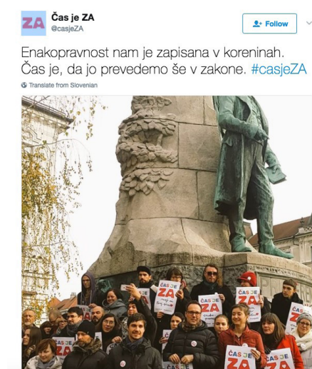
Figure 6: A tweet showing ČJZ supporters by the Prešeren Monument in Ljubljana (Caption: “Equality is rooted in all of us. The time has come to incorporate it into legislation. #timeFOR”).

the strongest non-verbal messages, as the supporters of the amendment were photographed under the monument to the poet France Prešeren in one of the main squares in the capital, Ljubljana (see Figure 6). Prešeren is the author of the lyrics of the Slovenian national anthem, celebrating equality among nations and individual freedom: “ Živé naj vsi naródi, // ki hrepené dočákati dán, // da kóder sónce hódi, // prepír iz svéta bó pregnán, // da roják, // prost bo vsák, // ne vrág, le sósed bo meják. ” (Eng. “God’s blessing on all nations, // Who long and work for that bright day, // When o’er earth’s habitations // No war, no strife shall hold its sway; // Who long to see // That all men free // No more shall foes, but neighbours be.”).