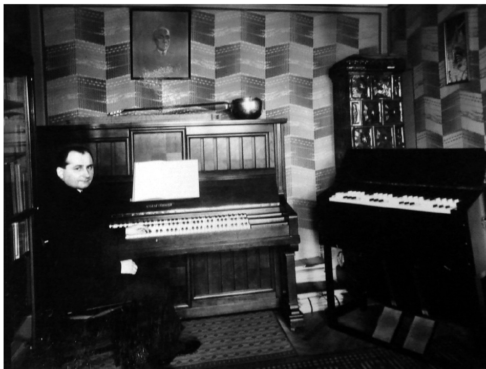
Example 1. Alois Hába at his quarter-tone piano, 1930s.

Edition publishing house, Hába claimed to have created a school and intended to make it a European school of composition. On the national scene, he first had to compete with influential Czech teachers of composition classes who had gained international recognition. From that viewpoint, in the area of traditional composition in the Prague Conservatoire, the most outstanding classes were those given by Vítězslav Novák and Karel Jirák. However, Hába had wider ambitions: an active participant of the international musical scene, he tirelessly promoted his pupils' works and sought wider international representation for his school. Especially in the '1930s, when compositions by Hába's pupils and special concerts of quarter-tone music continued to be included in the ISCM festival program, the Czech composer's ambitions to present his creative method and the movement of his followers as an alternative to the New Viennese School were growing.