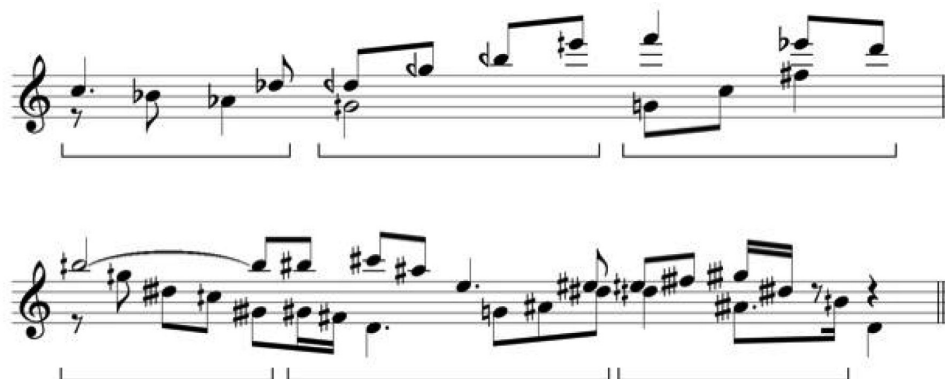
Example 6: Hába's illustration of contrary motion between fields ( Neue Harmonielehre des diatonischen, chromatischen, Viertel-, Drittel-, Sechstel-, und Zwölftel-Tonsystems, 1927; quoted after Skinner 2006 )

The examples above demonstrate that Kačinskas adopted and consistently applied Hába's theoretical concepts and principles of composition practice in his athematic and microtonal music. In a certain way this also supports Mirko Očadlík's observation that: